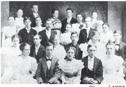
Class of 1897

passing from St. Louis to Terre Haute known as the Alton and Terre Haute railroad, with a view of obtaining a good supply of water and other conveniences for the use of the institution."