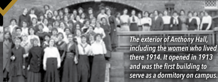
The exterior of Anthony Hall, including the women who lived there 1914. It opened in 1913 and was the first building to serve as a dormitory on campus.

The Southern Illinois Normal University women's basketball team of 1906.