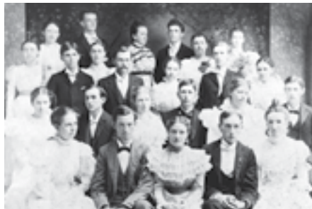
Class of 1897

passing from St. Louis to Terre Haute known as the Alton and Terre Haute railroad, with a view of obtaining a good supply of water and other conveniences for the use of the institution."