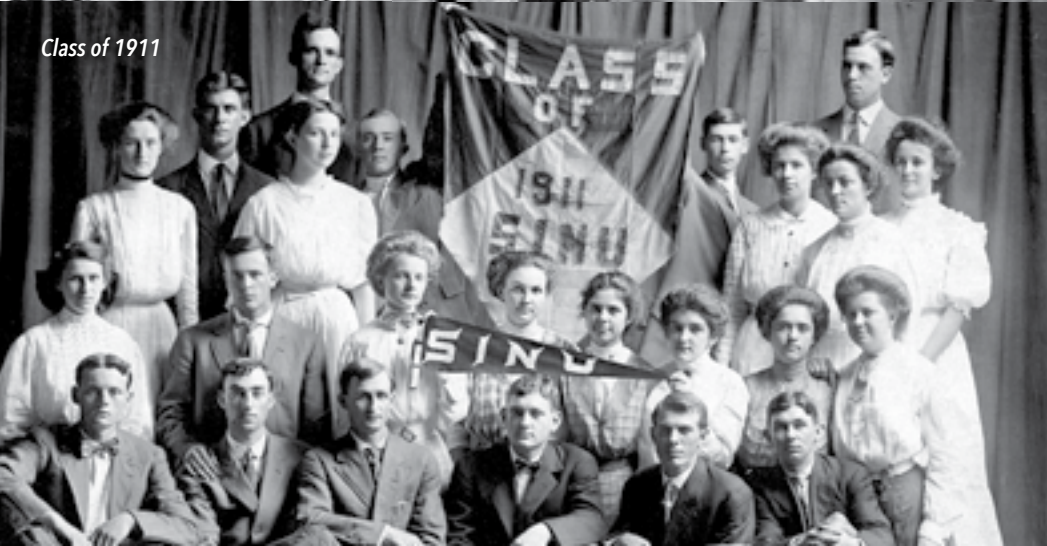
Class of 1911