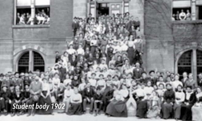
Student body 1902