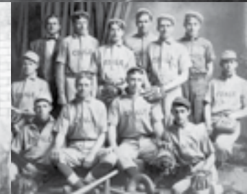
1909 Southern Illinois Normal University baseball team.