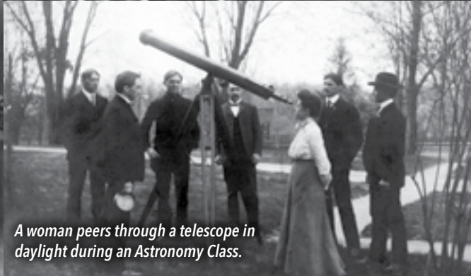
A woman peers through a telescope in daylight during an Astronomy Class.