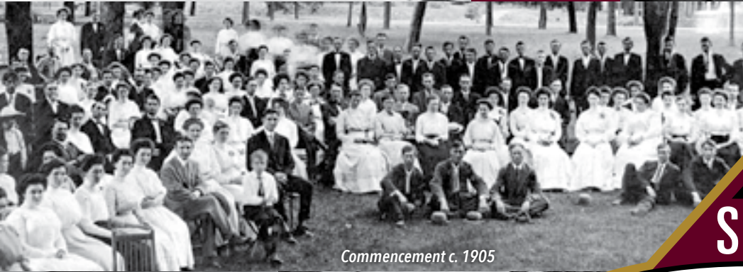
Commencement c. 1905