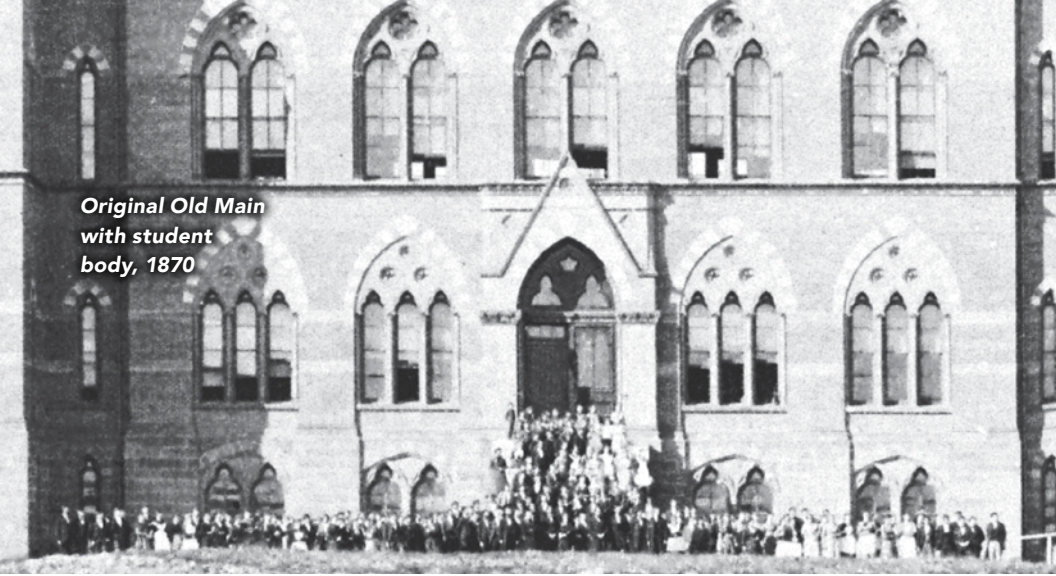
Original Old Main with student body, 1870