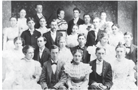
Class of 1897

passing from St. Louis to Terre Haute known as the Alton and Terre Haute railroad, with a view of obtaining a good supply of water and other conveniences for the use of the institution."