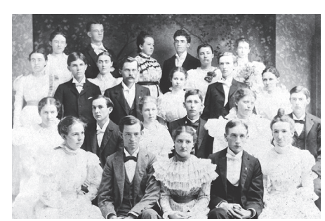
Class of 1897

passing from St. Louis to Terre Haute known as the Alton and Terre Haute railroad, with a view of obtaining a good supply of water and other conveniences for the use of the institution."