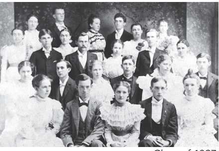
Class of 1897

passing from St. Louis to Terre Haute known as the Alton and Terre Haute railroad, with a view of obtaining a good supply of water and other conveniences for the use of the institution."